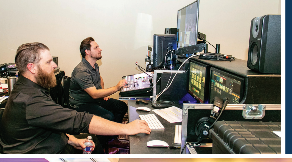
Left: Presenting sponsor Relevant Audio+Visual runs the show behind the scenes.

Below : Hundreds of supporters gather for Heartspring's sixth annual Light Your Heart with Heartspring fundraising gala.